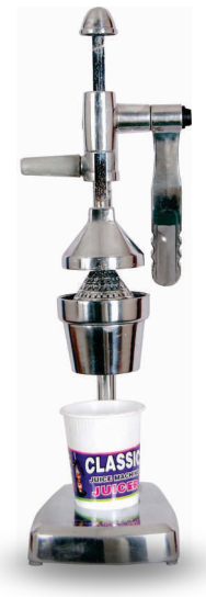
Monu White Juicer