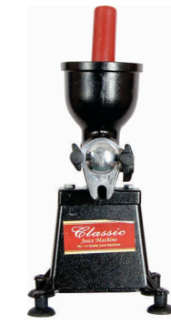
Juicer No. 18