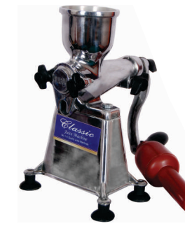
Juicer No. 15